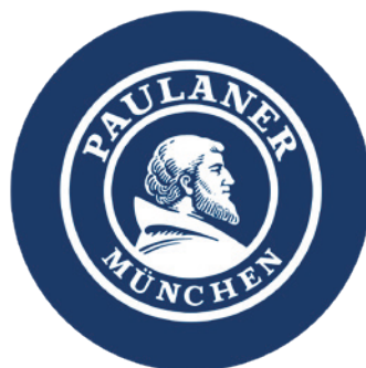
RESTAURANT PAULANER PETROZAVODSK